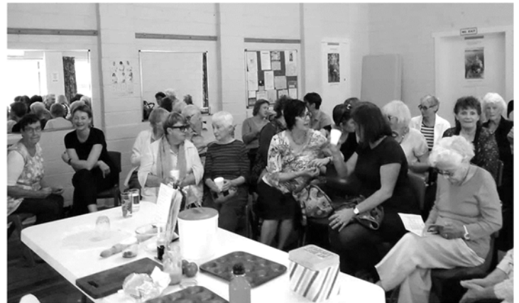
Participants in Helen Swain's 'Tart Words' presentation.

The Monday morning Open Door program at Mount Stuart Hall has continued to be popular, with recent sessions involving Tai Chi, no-dig gardening, Pilates, children's play and art activities and making rugs from rags and rubbish.