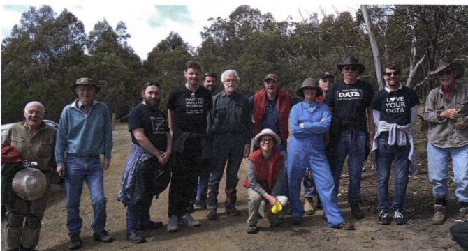
A recent Bushcare Group outing.

Friends of Knocklofty has a great website – http://www.friendsofknocklofty.org/